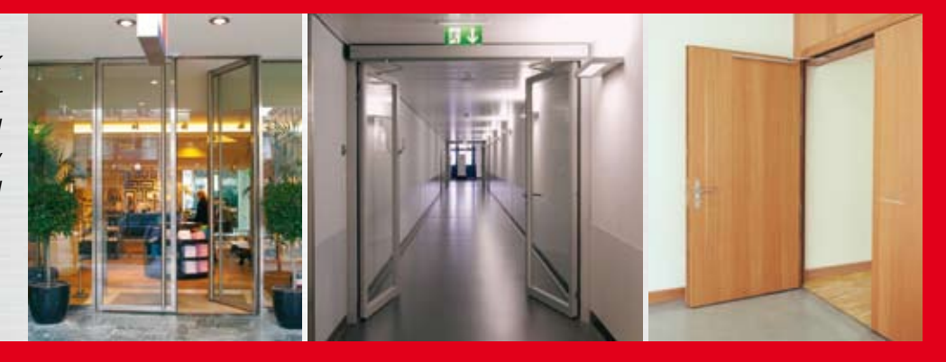
Our certified TORMAX partners mount the door systems professionally and adjust them competently to your applications and safety requirements.

TORMAX swing door drives have up to four monitored safety features. They thus comply with the strictest current requirements. The door can be opened manually during a power cut, it closes automatically again. Various sensor systems and standard locks are available to cover all safety requirements.