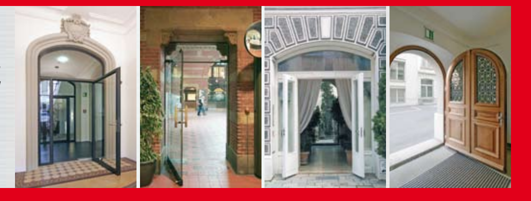
Automatic swing doors of TORMAX always harmonise everywhere with the existing conditions and architectural prerequisites.

Variable design, combined with the almost unlimited technical possibilities provided by TORMAX make it possible for you to automate every swing door optimally – in listed houses just as in modern buildings. The choice of door filling is not limited: wood, glass, plastic, steel or any other material is possible. The door profiles can be stove-enamelled in any desired colour, powder-coated or anodised colourless. If the drive is in the floor, you also have a free choice with regard to shape of the door.