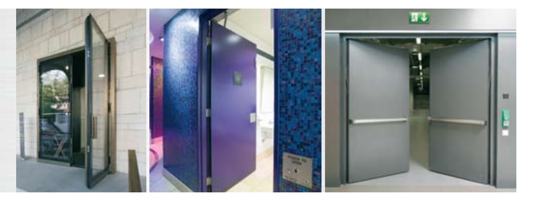
Automatic swing doors or the automation of manual doors: you find exactly the solutions you need at TORMAX.

Automatic swing doors of TORMAX seal the entrances to such an extent that it stays warm inside and cold outside – and vice-versa. Odours, sounds and noises also stay where they arise and thus the adjoining rooms and areas are not burdened.