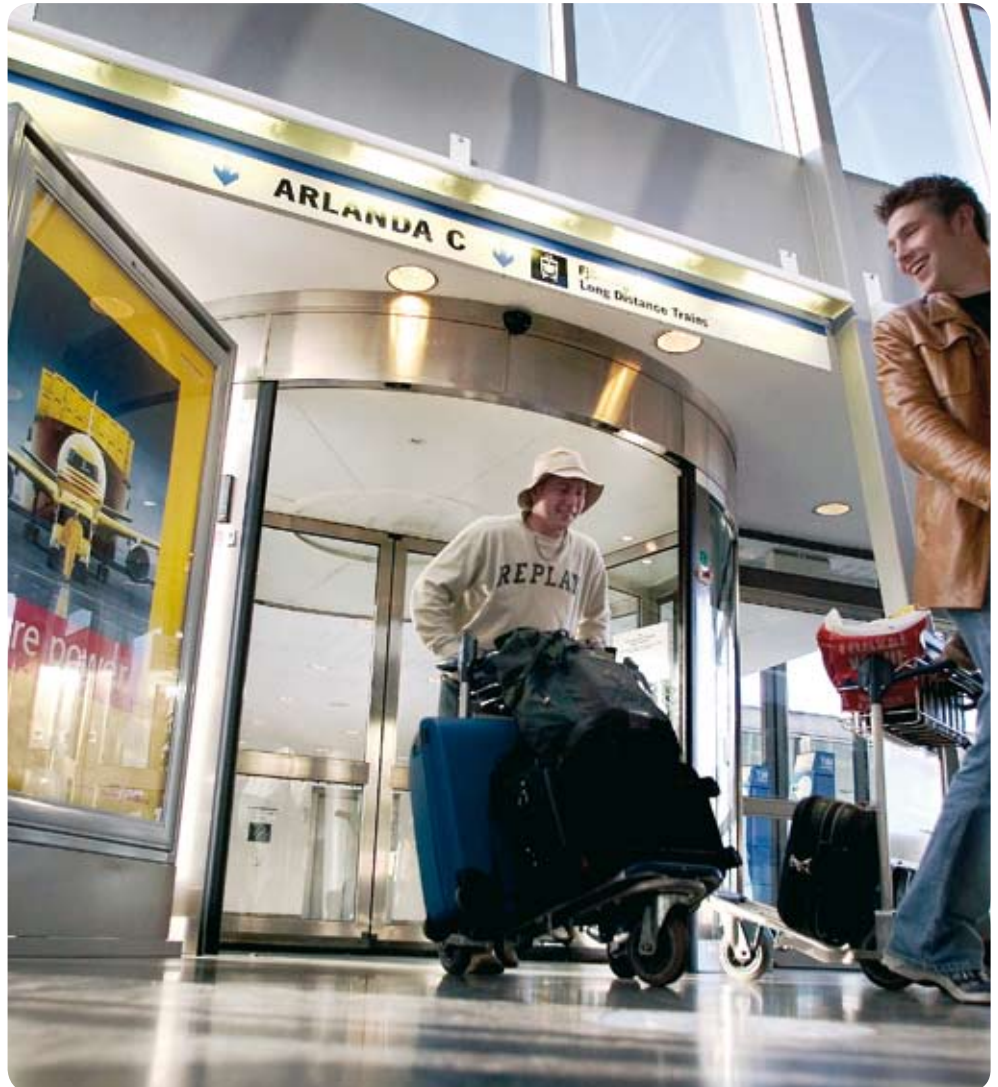
Arlanda Airport – Stockholm, Sweden