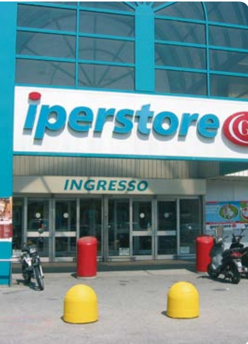
Iperstore – Novara, Italy