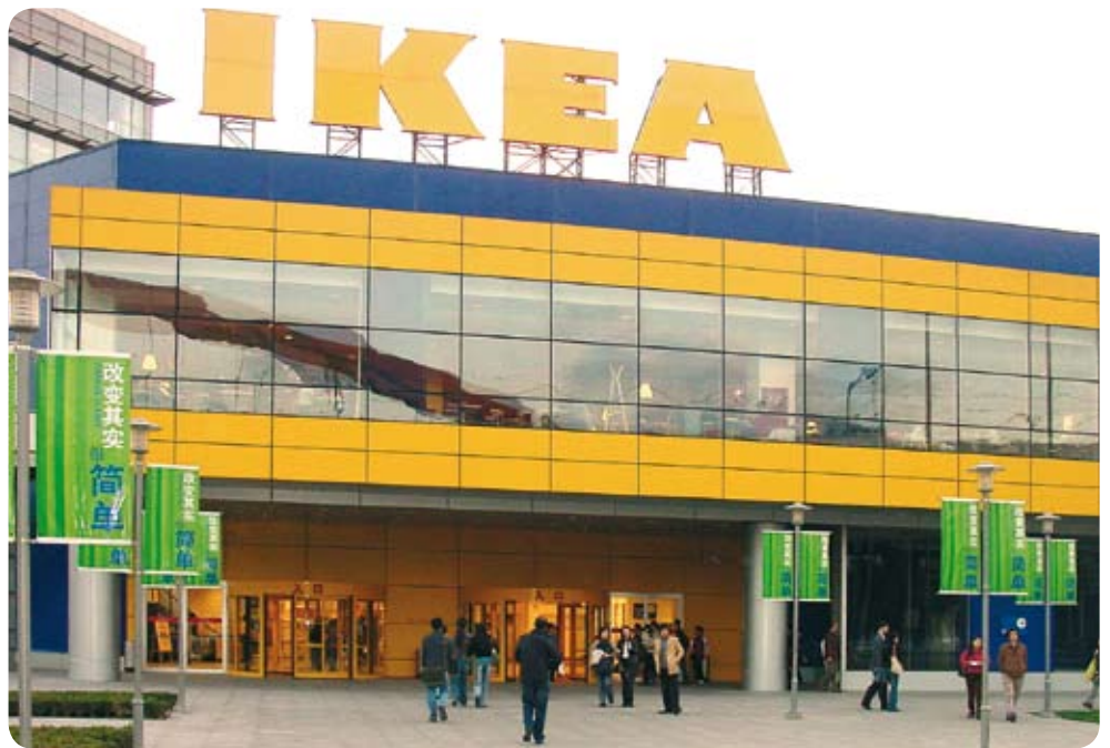
IKEA – Shanghai, China