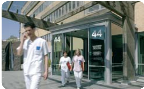
Diagnostic Center MAS – Malmö, Sweden