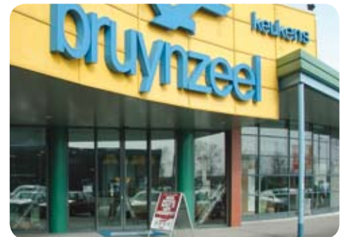
Bruynzeel keukens – Bergen op Zoom, Netherlands