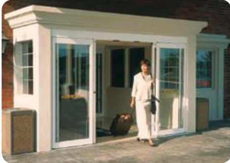
Clarion Hotel – Cleveland, Ohio, USA