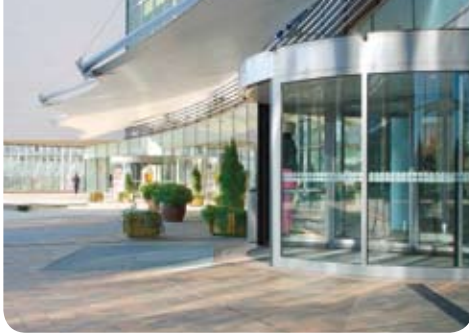
Europa Shopping Center – Vilnius, Lithuania