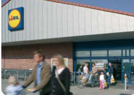
Lidl – Landskrona, Sweden