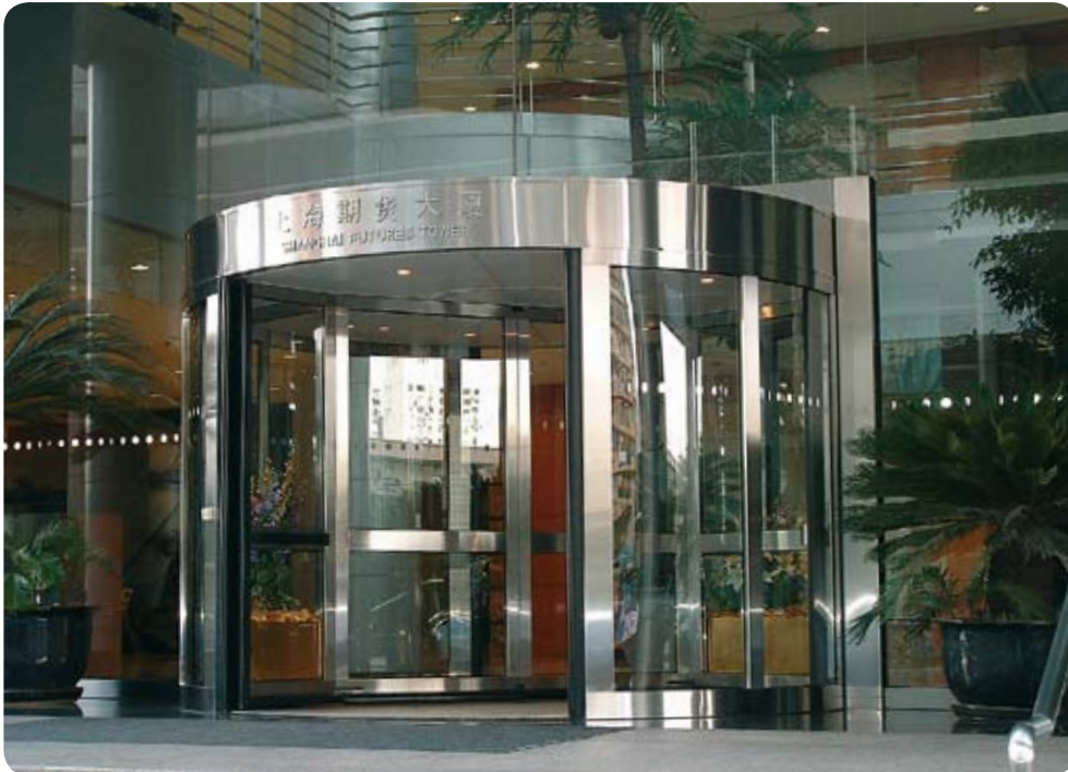
Future Tower – Shanghai, China