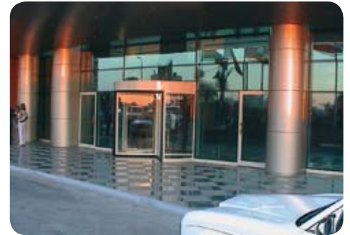
Metropolitan Hotel – Dubai, United Arab Emirates