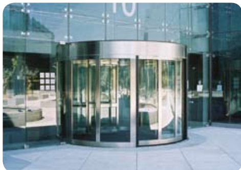
La Finca – Madrid, Spain