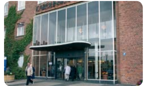
Karolinska hospital – Solna, Sweden