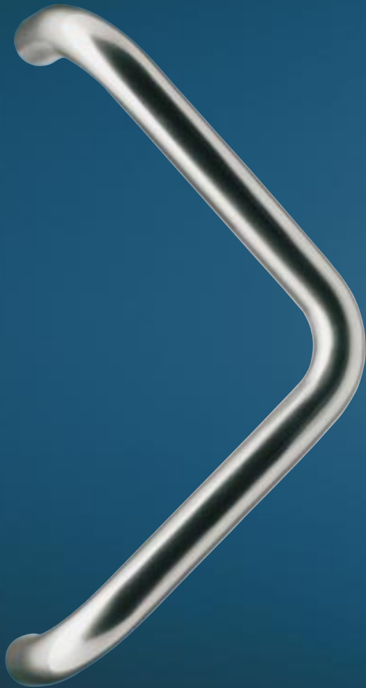
TG 9159 Angled handle – Length 350 mm