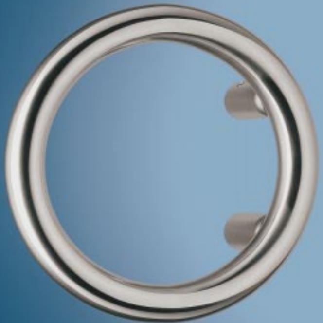
TG 9313 Circular handle – Diameter 200 mm